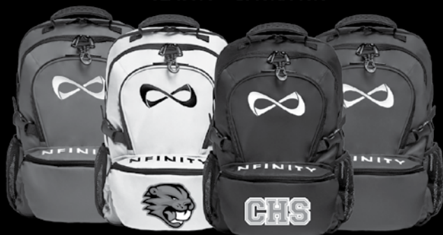
RIVAL 2 $69.99